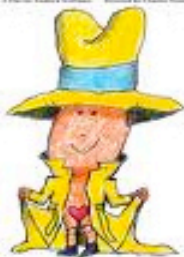
The Accidental Pervert Production